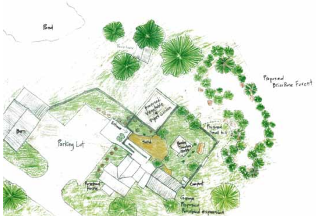
Proposed Briar Forest

The mission of Briar Rose Forest is to provide a natural forest setting as an environment that will support creative, self-initiated play of the young child. To provide a direct experience of nature and the seasons so that a healthy relationship with nature can develop. To make possible the daily experience of the beauty, wonder and awe of the forest. To learn to care for nature by becoming stewards of Briar Rose Forest by developing a healthy, loving relationship with the forest as a natural environment to be cared for and explored.